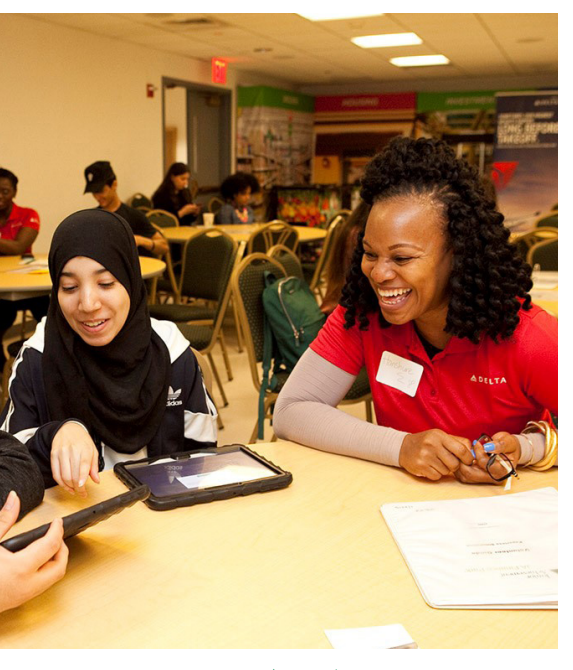
540,000 CONTACT HOURS