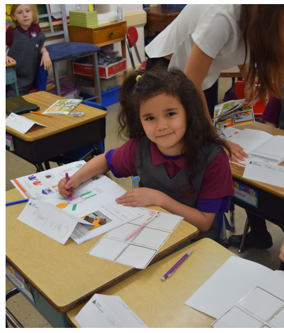
3,900 CLASSES SERVED